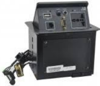
TABLE TOP POP UP BOX