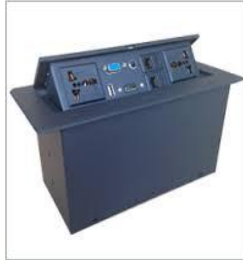
Table top pop up boxes provide multiple connectivity options for your conference table connection needs. Choose from a wide variety of pop up boxes for your computer, network, video, audio, HDMI connections and AC power specifications. We have both black and silver options to match the aesthetics of your conference room.